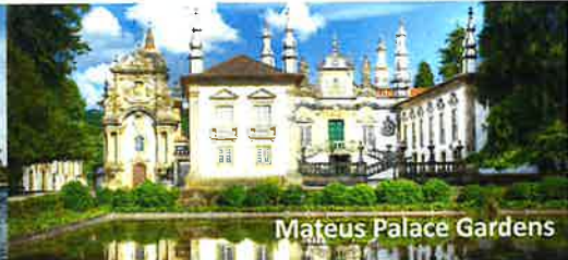
Mateus Palace Gardens