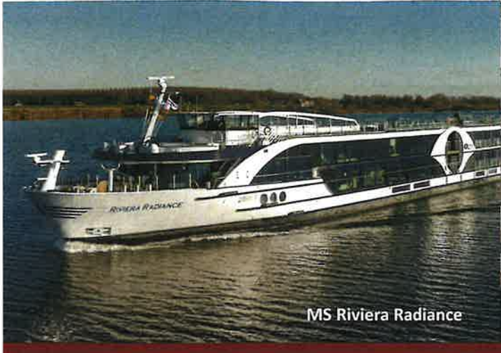
MS Riviera Radiance