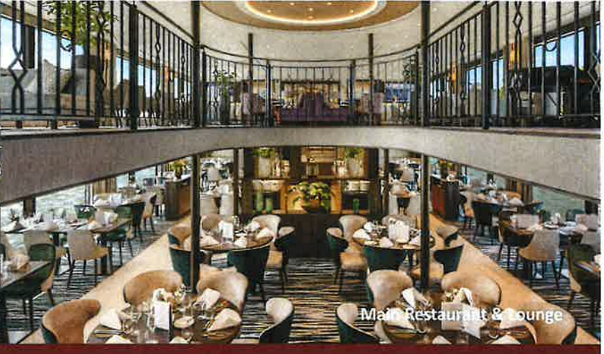
Main Restaurant & Lounge